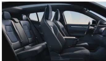
Indigo interior with Textile & Nordico upholstery