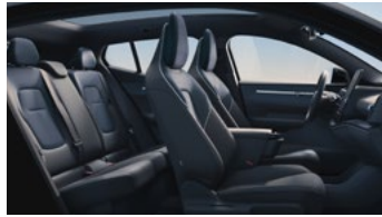
Indigo interior with Textile & Nordico upholstery