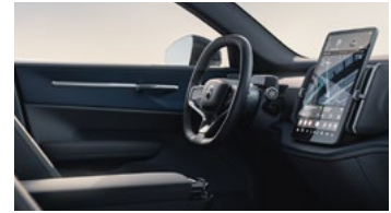
Denim decor panels with blue air vent panels