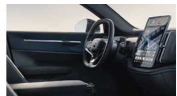
Denim decor panels with blue air vent panels